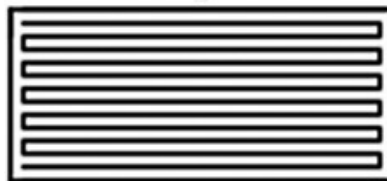
Figure 2: Example voxel

To print a 3cm cube, the 3D printer can’t just print the layers of material that make up the walls of the cube. To provide support, the slicer program must divide up the object into layers with support structures called infills. The image below illustrates the “scanline rasterization” method that the infill pattern must be drawn in.