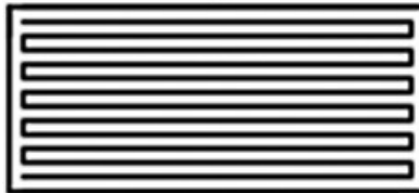
Figure 3: Example voxel

To print a 3cm cube, the 3D printer can't just print the layers of material that make up the walls of the cube. To provide support, the slicer program must divide up the object into layers with support structures called infills. The image below illustrates the "scanline rasterization" method that the infill pattern must be drawn in.